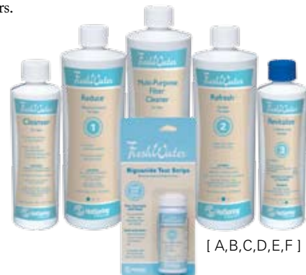
[ A,B,C,D,E,F ]

F. Specially formulated for use with biguanide, the Multi-Purpose filter cleaner is compatible with all types of sanitizers.