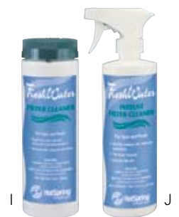
www.hot.spring.com | 9